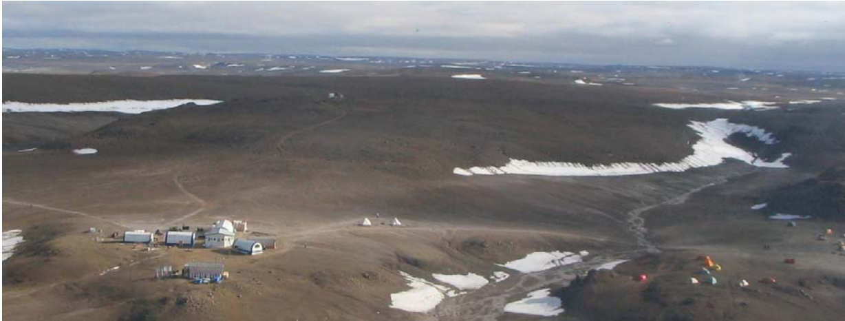
Figure 2: Aerial view of the Haughton Mars Base and surrounding terrain. The six core structures, including the newly erected MIT tent, can be seen on the left. Researchers sleep in the individual tents on the right.

the years and now supports up to sixty researchers over the six-week field season, with a variety of projects from universities, government, and industry.