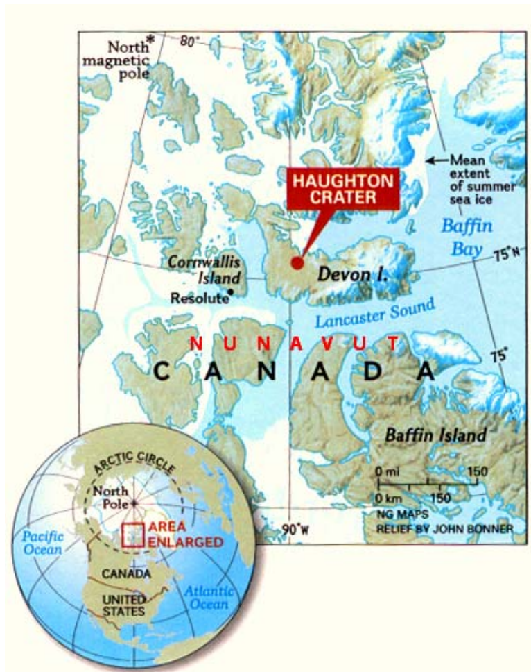
Figure 1: The High Canadian Arctic, with Resolute on Cornwallis Island and Devon Island indicated. Researchers stopped in Resolute on the way to the HMP base on Devon Island (75° N 90°W)

Beyond basic science, the remote Haughton Mars site functions as an analogue planetary base, supporting a diverse array of exploration technology and engineering test projects that also benefit from the Mars-analogue terrain, remoteness, and exploration-like activities undertaken by geologists and other scientists. For example, over the past several years, the Canadian Space Agency has supported the Arthur C. Clark Greenhouse project, to design, build, and test a greenhouse and autonomous plant-growth technologies in remote environments. Hamilton-Sundstrand, an aerospace engineering firm headquartered in Connecticut, uses the Haughton site to test advanced space suit designs. Also, this year the Drilling Automation for Mars Exploration (DAME) project, lead by the NASA Ames Research Center, tested autonomous fault diagnosis and artificial intelligence software on a prototype Mars drill. Many other exploration technologies and prototypes have been tested at the Haughton base since 1997.