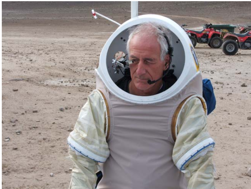
Figure 4: MIT Professor and former Astronaut, Jeff Hoffman, tests a Hamilton Sundstrand concept space-suit during an EVA test run.

The fourth major goal for the MIT expedition was to establish logistics requirements for extra vehicular activities (EVAs) through observations of short ATV traverses and longer excursions with overnight stays. This goal links EVA planning to the micro-logistics modeling efforts. MIT researchers accompanied geologists on excursions into the Haughton crater and other areas on Devon Island, recording planning strategies—re-planning in the case of unexpected events or discoveries—supplies taken along, and caching possibilities (e.g. via air delivery). Further, an MIT-developed re-planning software tool was tested.